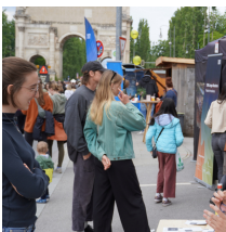
TUM booth at Munich's largest street festival