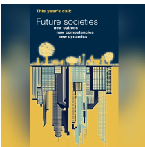
This year's call: Future societies