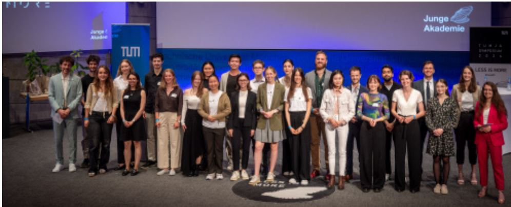
TUMJA #class23 at their Symposium "less is more."