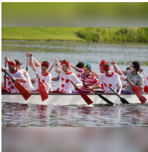
Our boat at the Dragonboat race 2024