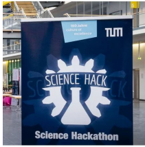
Getting Ready for ScienceHack 2025