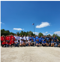
The best teams met at the EuroTheQaThon in Paris