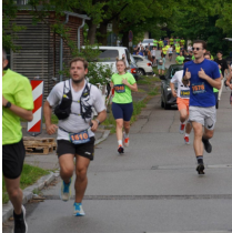
On the road in Garching: TUM Campus Run 2024